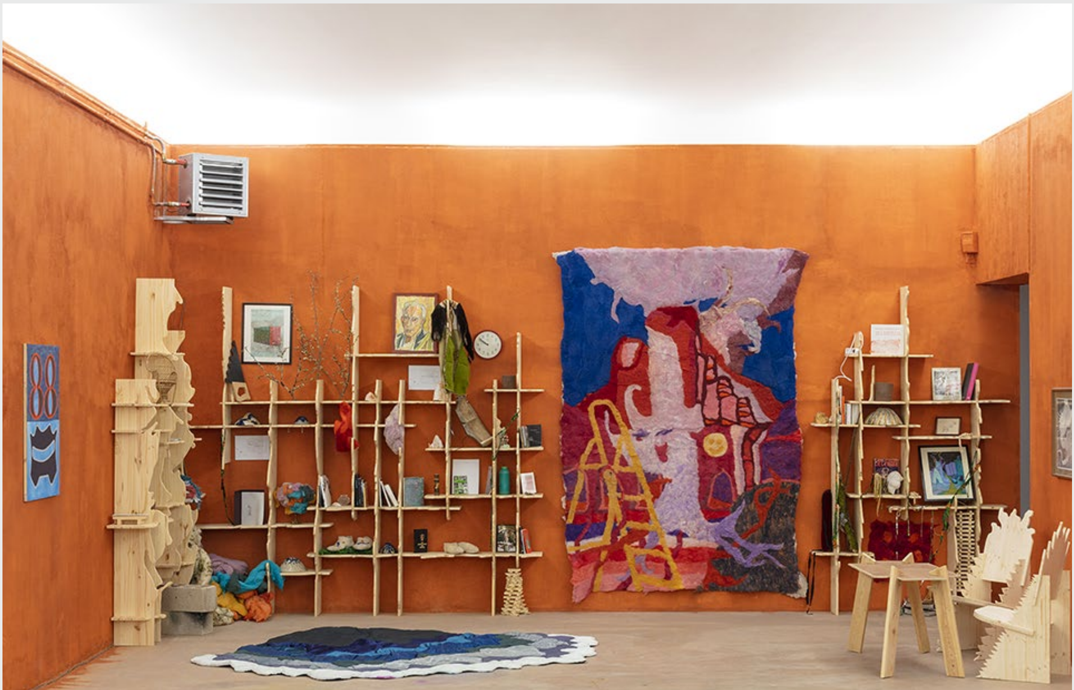
Cabinet de curiosité collectif en argile , bookshelf, table, chairs, clay plaster and collective collection of objects, 8 x 5 x 4 m, Maison des Arts Georges et Claude Pompidou, Cajarc, March-May 2021. Scale for scale , felt tapestry, 320x200 cm, 2021.