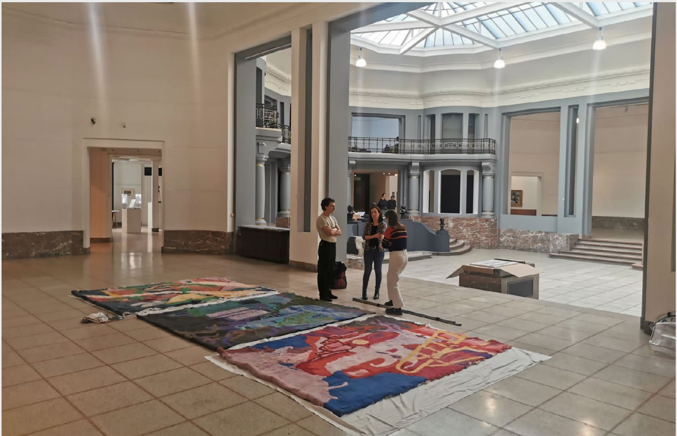
Montage for the Prix Artistique de Tournai 2022 , Group exhibition of the prize winners, Museum of Fine Arts, Tournai, from 15 October to 20 November 2022.