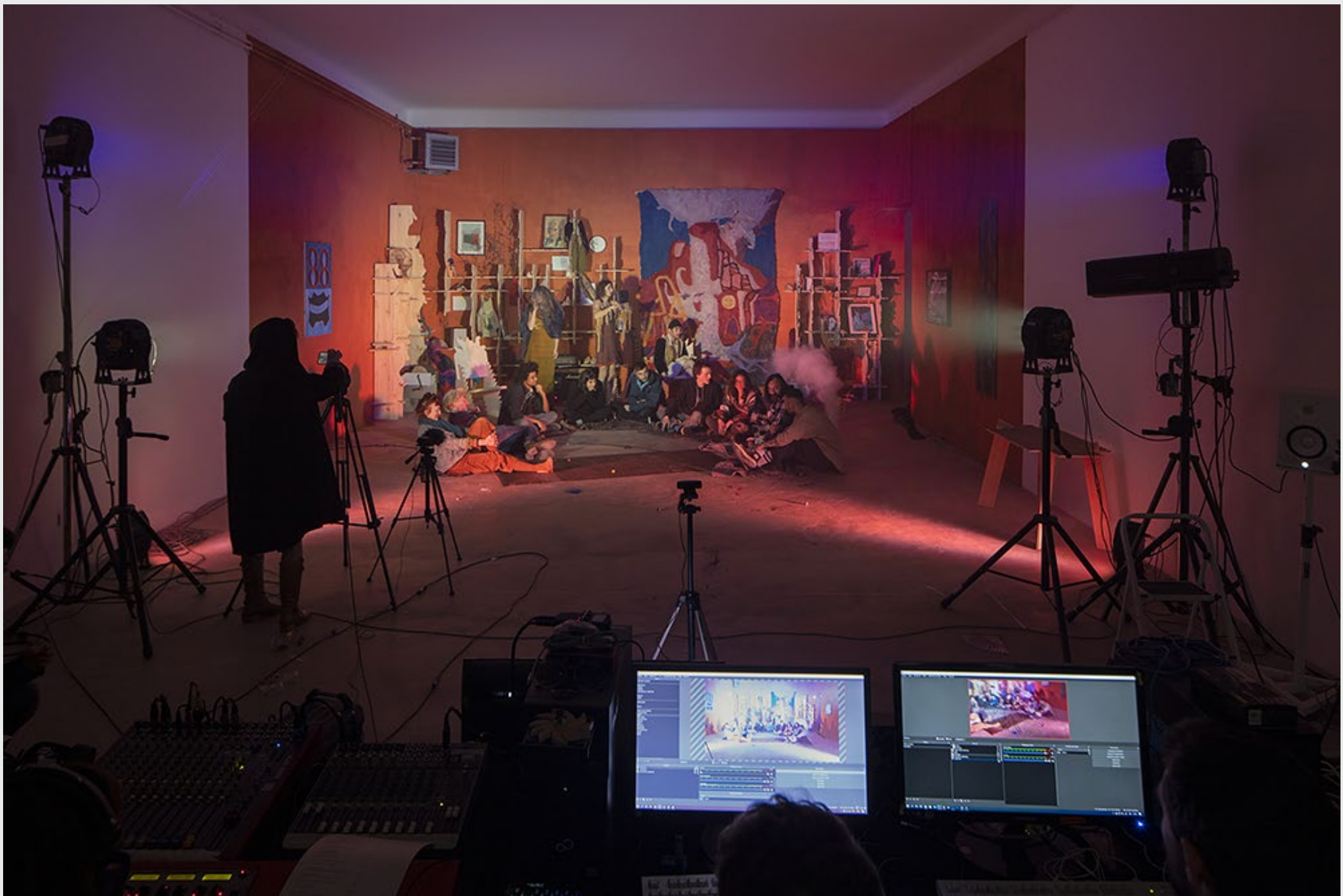
Ouverture du festival MAGMA, https://youtu.be/wN8ZvVFNQUo?t=206 , Collective live stream, jour 2, 2h29, 20 mars 2021, Cajarc, France.