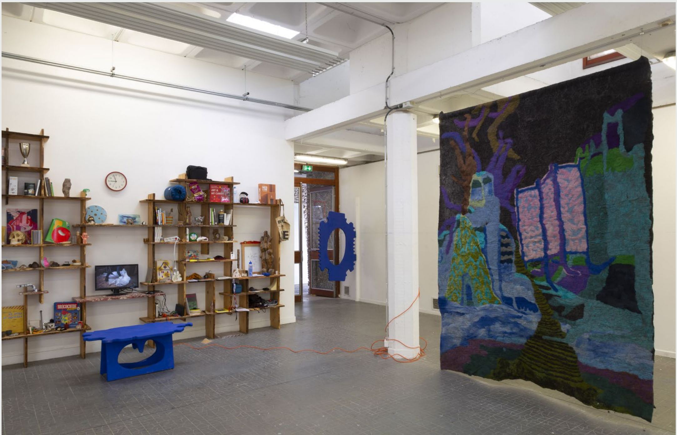
Nous n'habitons vraiment que les choses (!?), DNSEP installation, Villa Arson Nice, June 2022, Chestnut bookshelf, bench, door, and collective collection of objects.