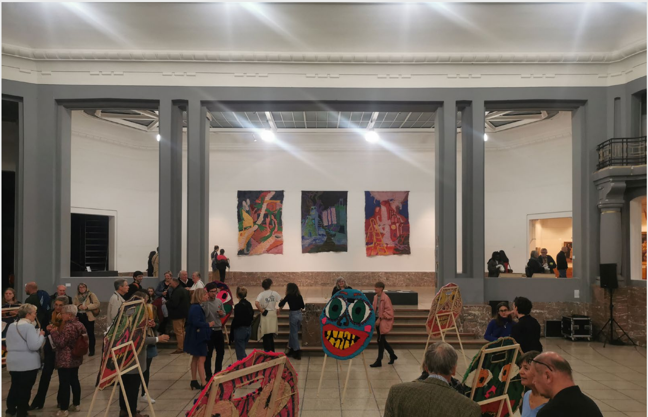
Prix Artistique de Tournai 2022 , Group exhibition of the prize winners, Museum of Fine Arts, Tournai, from 15 October to 20 November 2022.