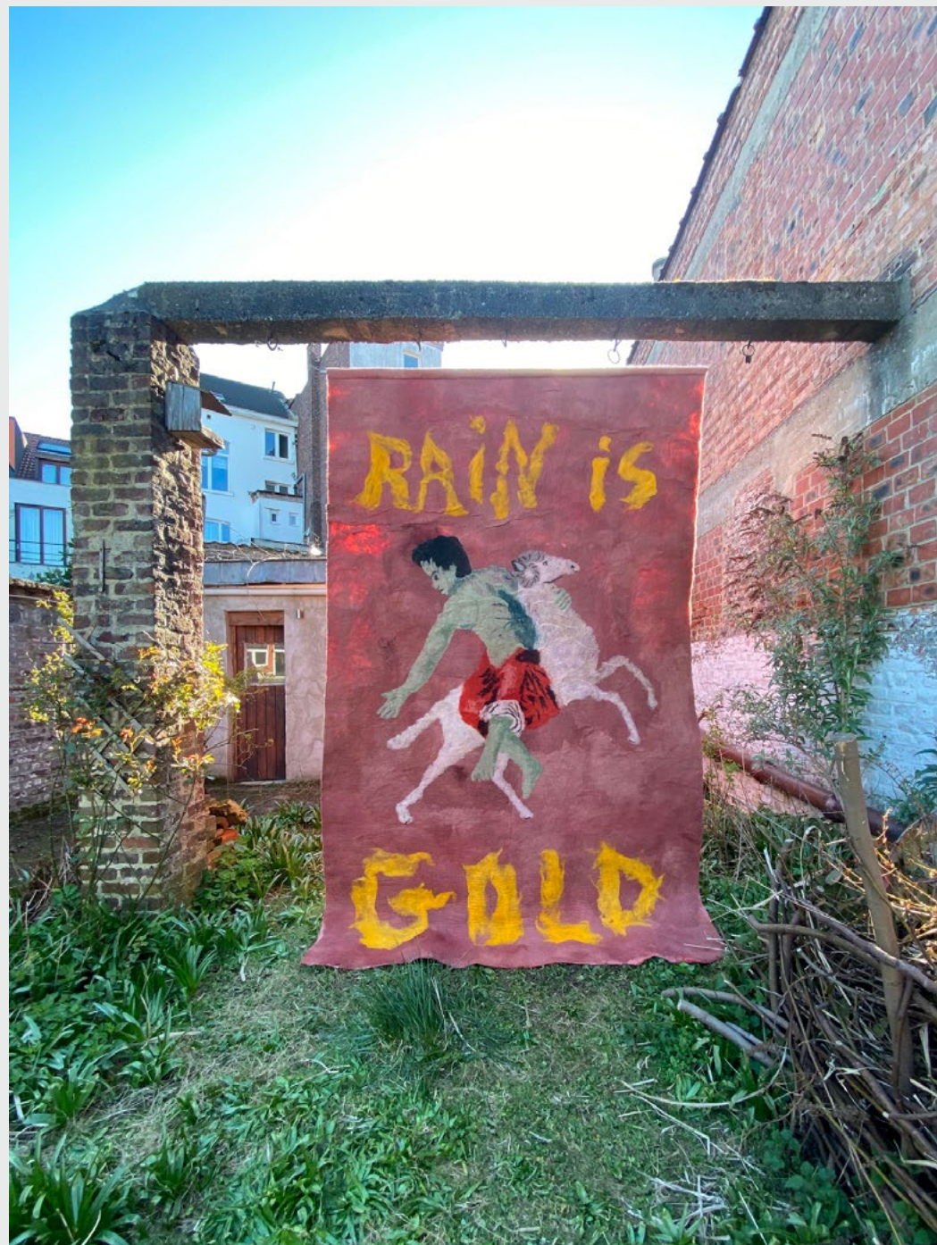
Rain is Gold, Phrixos, Hellé et Chrisomallos, double-sided felt tapestry, 320x200 cm, 2023.