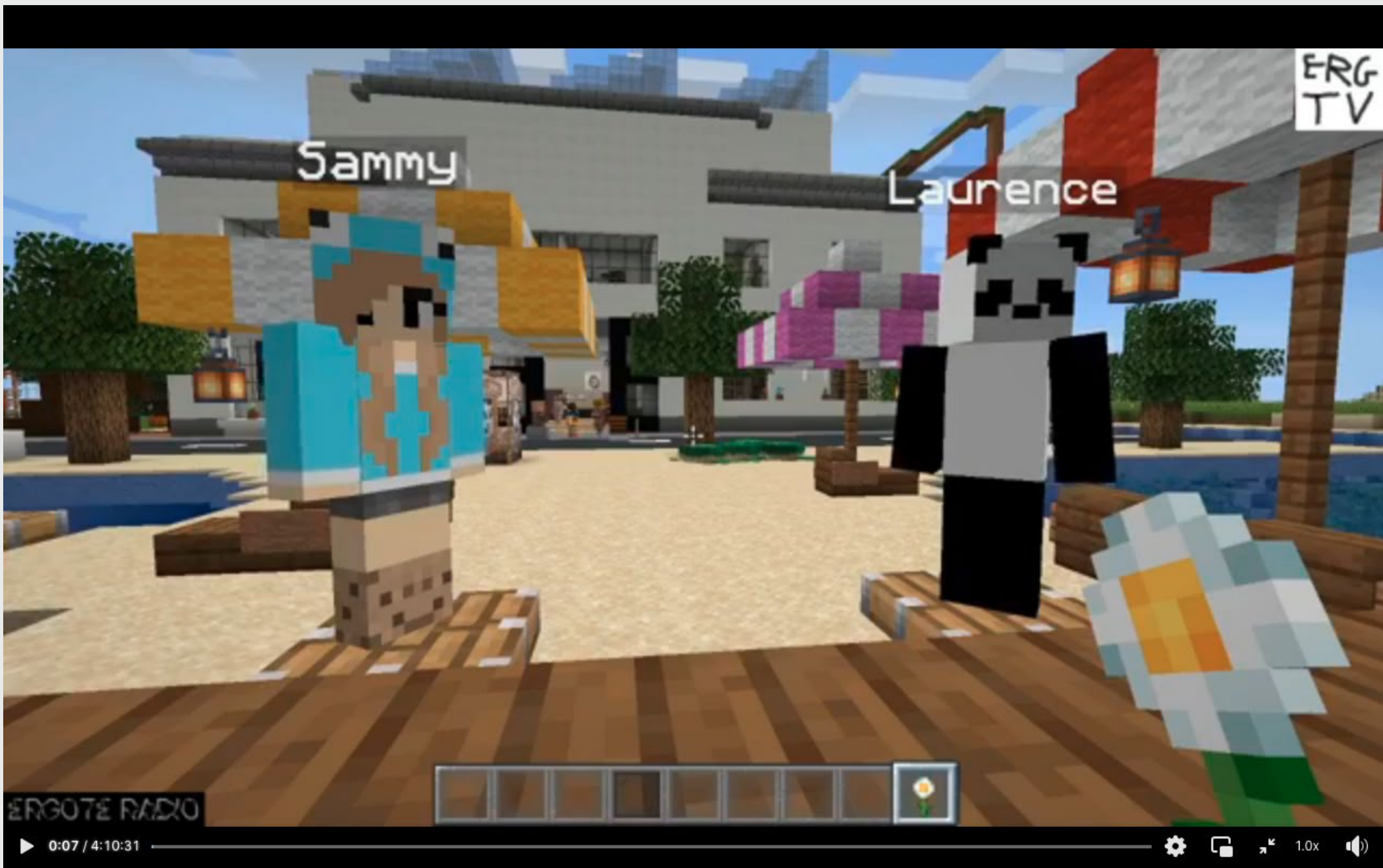
Erg 5 , https://www.facebook.com/erg.tele/videos/261637985265393 , live stream, 4h10min, 20/06/2020, digital open doors of the ERG, Bruxelles on a private Minecraft server, built for the occasion, reproducing the whole school at 1:1. Produced by ErgTv and ErgoteRadio.