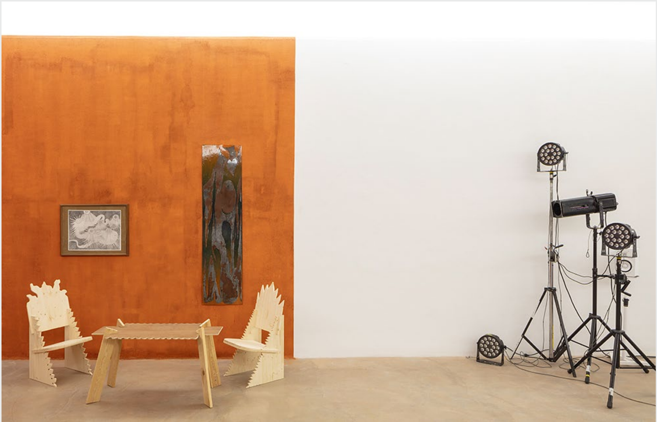
Mobilier , table and chairs, glued laminated pine, 2021.