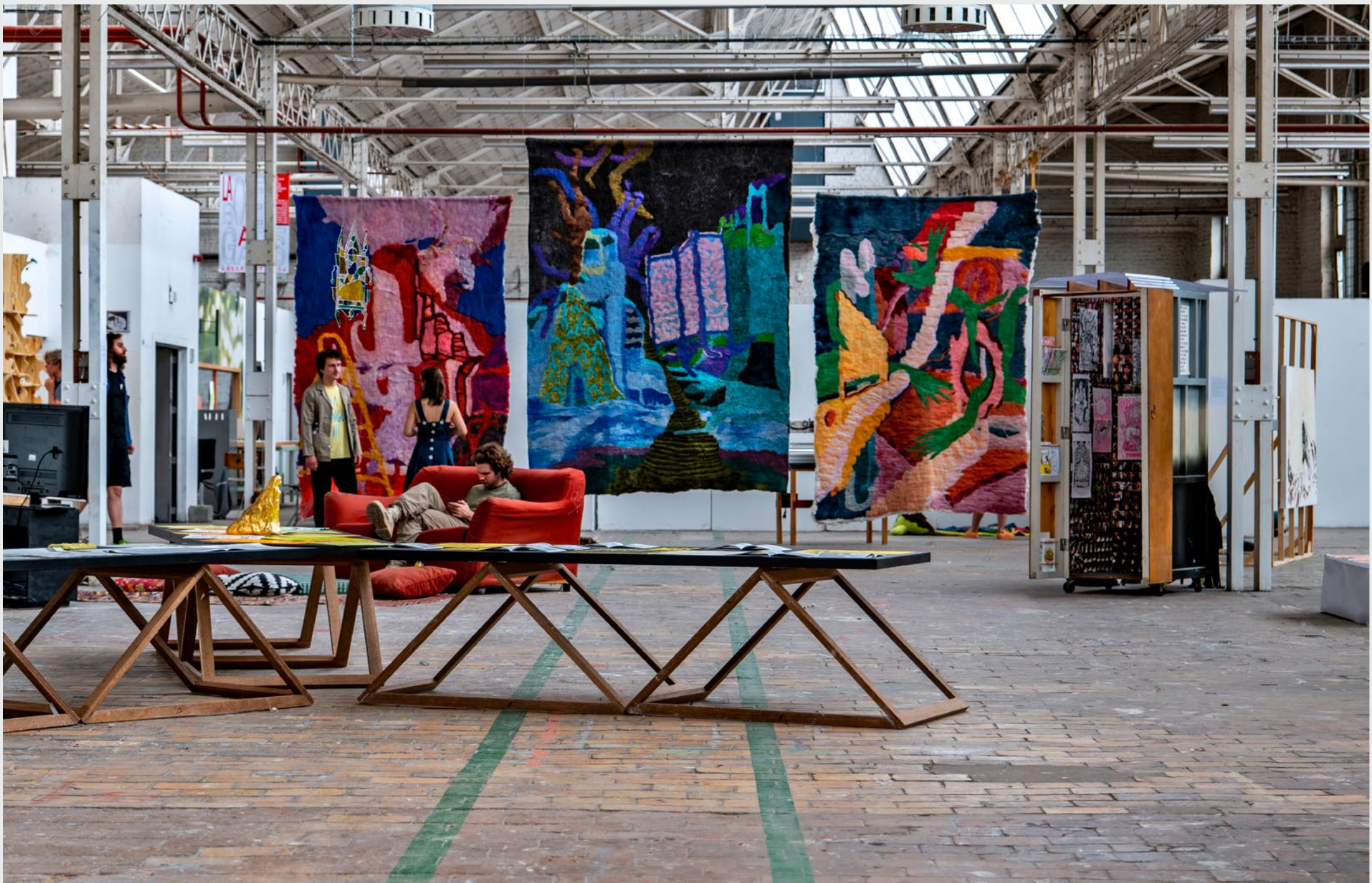
Good things take time , Jury installation, ERG Brussels, Master 2 PAOC, June 2022, 3 tapestries, bookcase, saloon door, screens, moose fleeces and needlework machine.