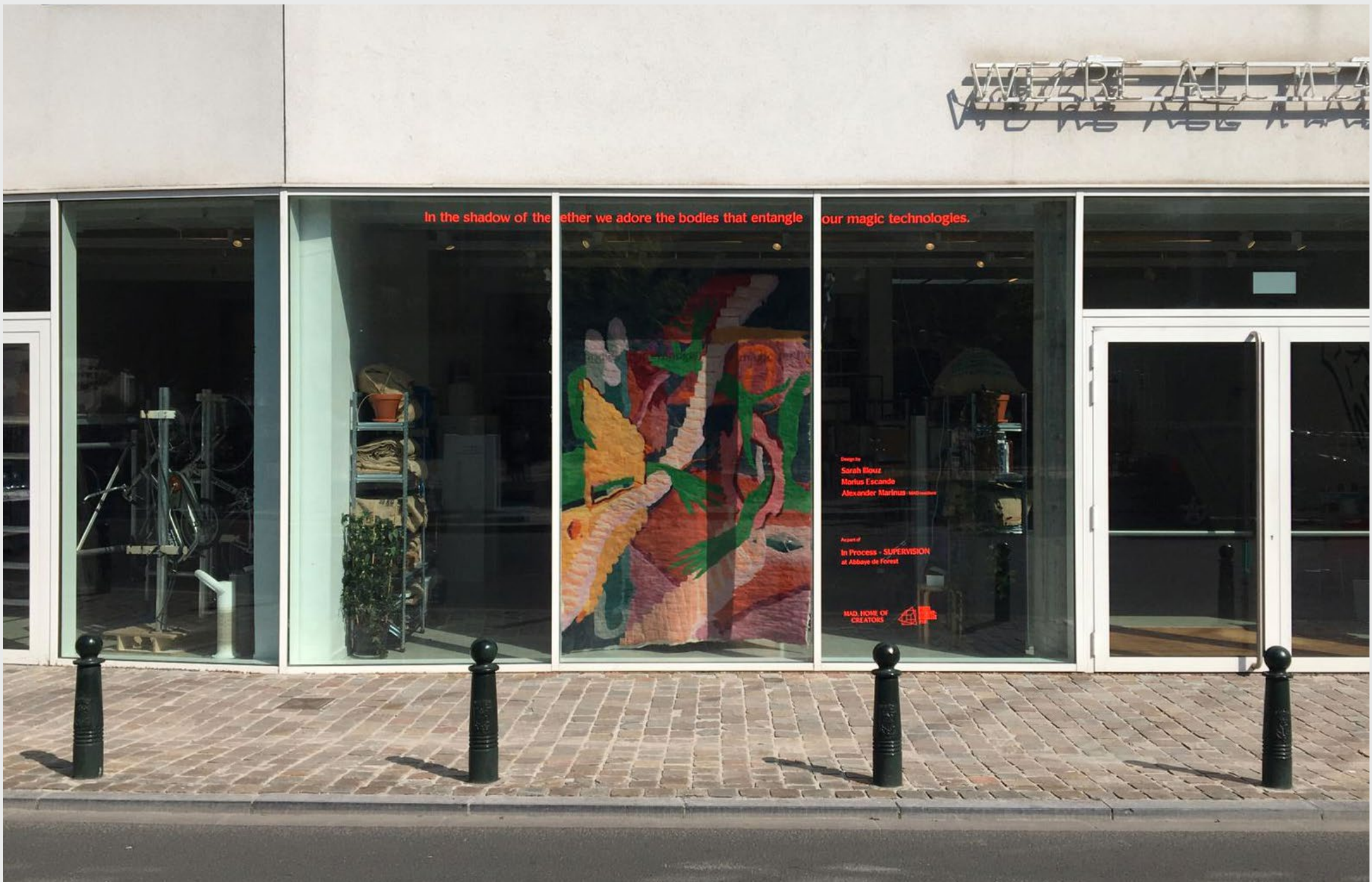
In the shadow of the ether we adore the bodies that entangle our magic technologies , Felt tapestry, 320x220 cm, MAD Brussels, June 2021.