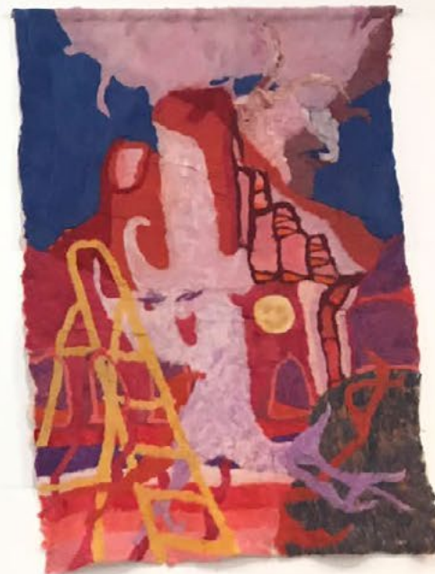
Prix Artistique de Tournai 2022 , Group exhibition of the prize winners, Museum of Fine Arts, Tournai, from 15 October to 20 November 2022.