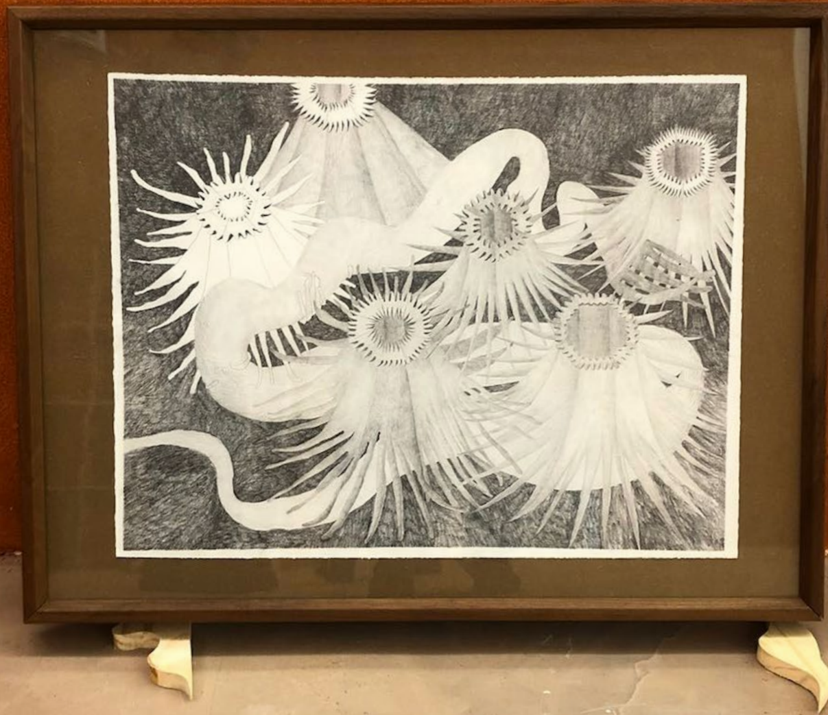
Sans titre , pencil on paper, 50x65 cm, 2021.