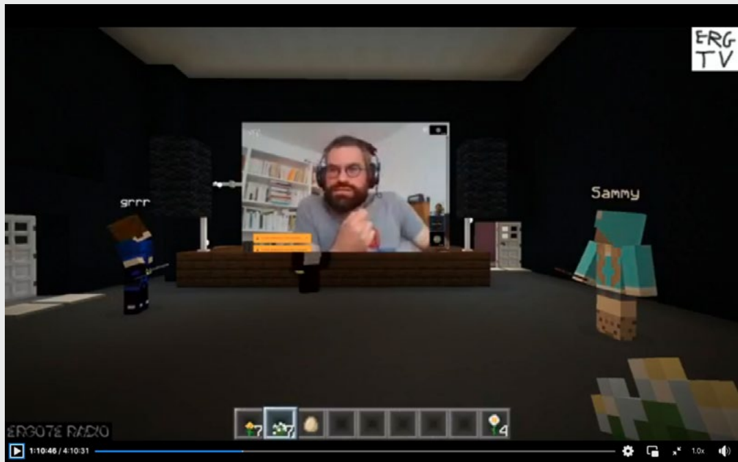
Erg s , https://www.facebook.com/erg.tele/videos/261637985265393 , live stream, 4h10min, 20/06/2020, digital open doors of the ERG, Bruxelles on a private Minecraft server, built for the occasion, reproducing the whole school at 1:1. Produced by ErgTv and ErgoteRadio.