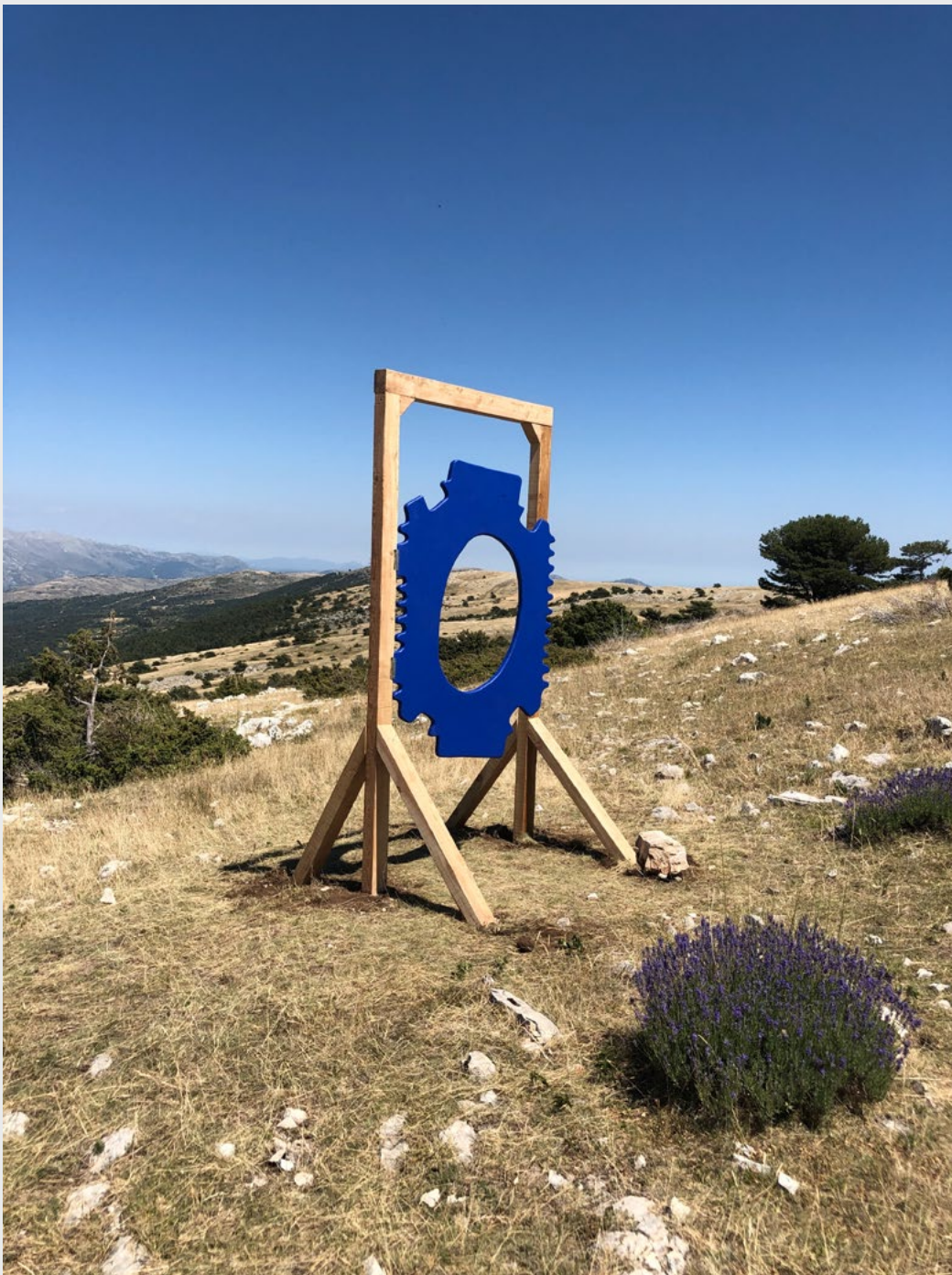
« Prière de laisser cet endroit comme vous désirez le trouver en entrant », Sculpture for the Thorenc 2022 Prize, installed on the summit of Audibergue. Door and uprights in local pine and larch, hinges to and fro, June 2022.