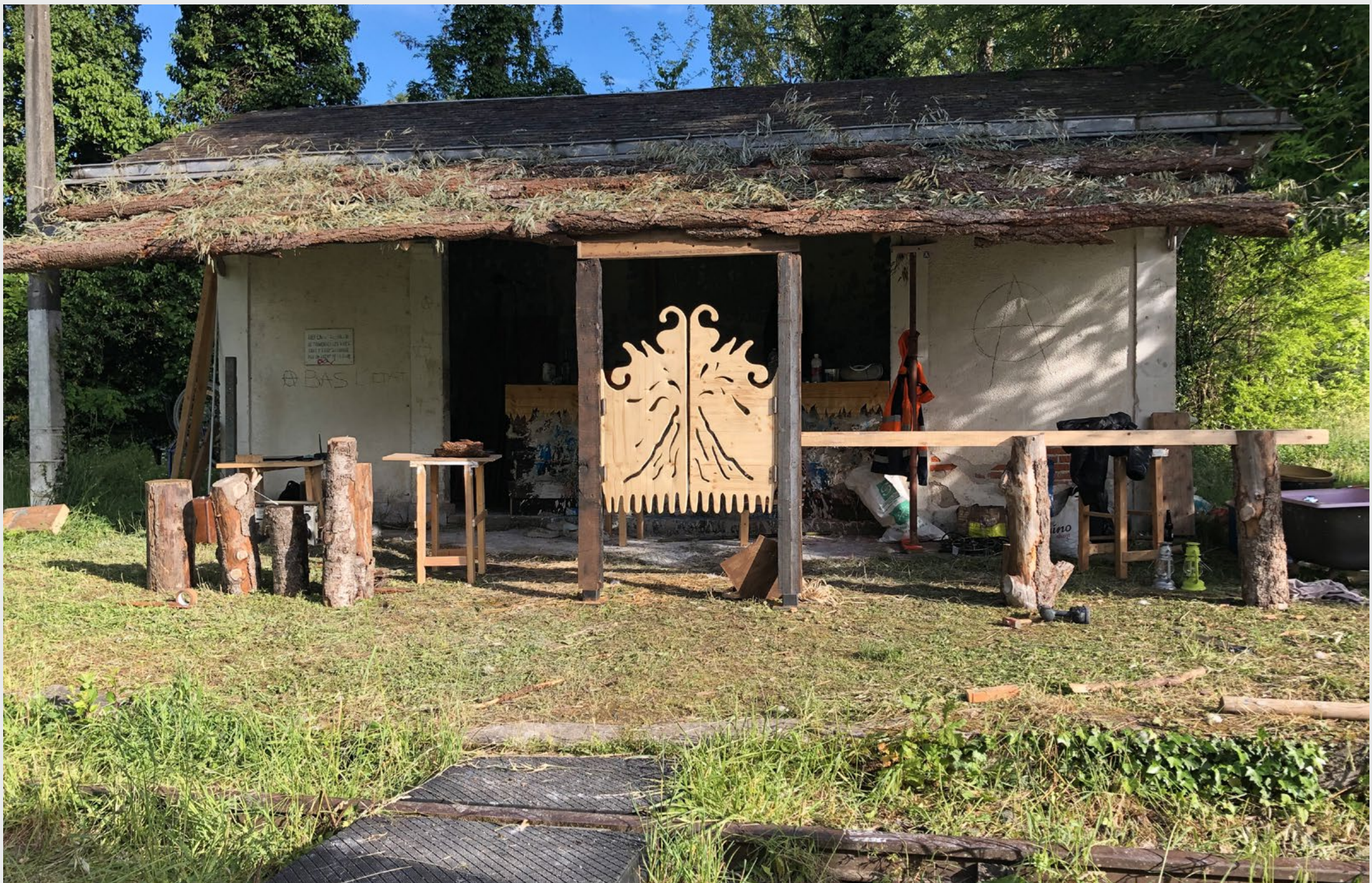
MAGMA , Saloon door, glued laminated pine, 2.50 x 1 m, Festival Magma closing weekend, MAGCP Cajarc, May 2021.